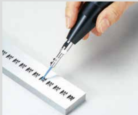
▲Lapping super-minute areas with ceramic superstone.