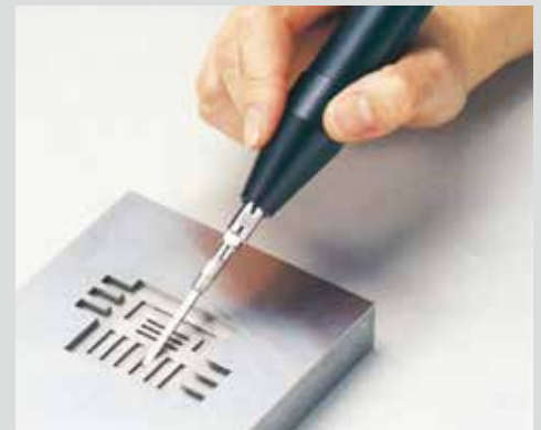
▲Lapping minute areas after heatsinking with a metal bond-diamond tip.